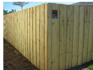
Board on Board